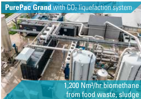
PurePac Grand with CO 2 liquefaction system

1,200 Nm 3 /hr biomethane from food waste, sludge