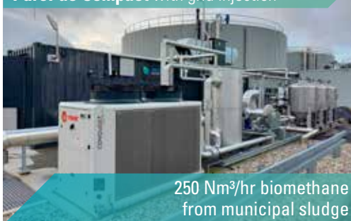
PurePac Compact with grid injection

250 Nm 3 /hr biomethane from municipal sludge