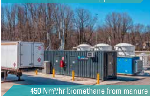
PurePac Medium with virtual pipeline

At this anaerobic digestion facility, our large-scale upgrader produces 10 million Nm 3 of biomethane per year from 30 different waste streams. The CO 2 liquefaction system produces food-grade CO 2 for industry sales.