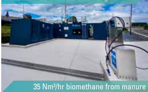
PurePac Mini with bio-CNG filling station

From feces and sewage sludge waste to biomethane-to-grid. This wastewater treatment plant with a compact build biogas upgrader produces enough biomethane for the gas needs of 1,500 households.