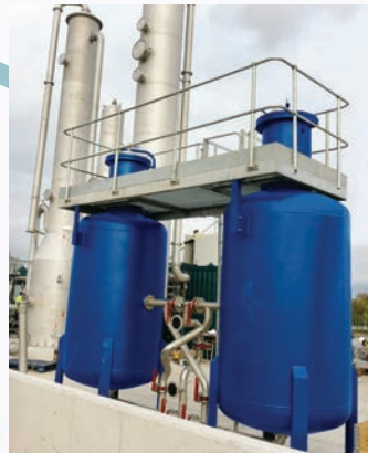
CO 2 STRIPPING