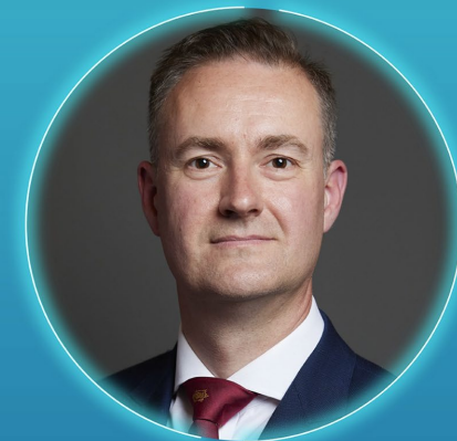
Chris McDonald MP

Parliamentary Under-Secretary of State in the Department for Energy Security and Net Zero