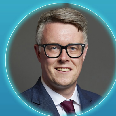
Martin McCluskey MP

Parliamentary Under-Secretary of State in the Department for Energy Security and Net Zero