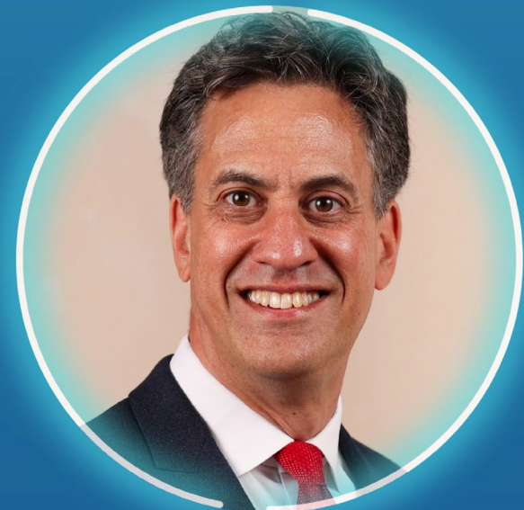
Lord Patrick Vallance KCB

Minister of State in the Department for Energy Security and Net Zero