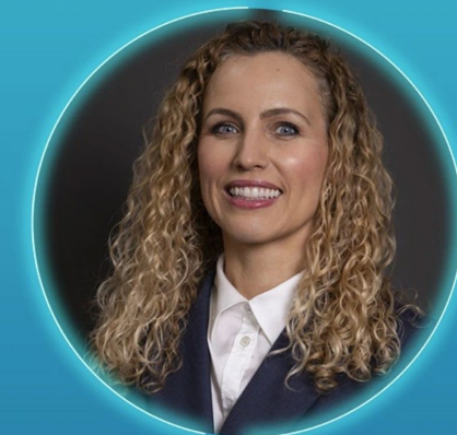
Katie White OBE MP

Parliamentary Under-Secretary of State in the Department for Energy Security and Net Zero